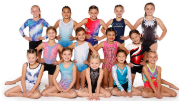
Women's Xcel Bronze