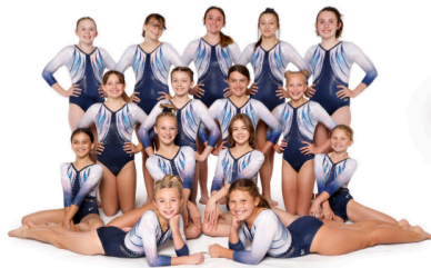
Women's Xcel Gold