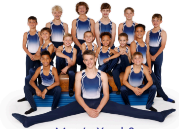
Men's Xcel & Developmental Levels